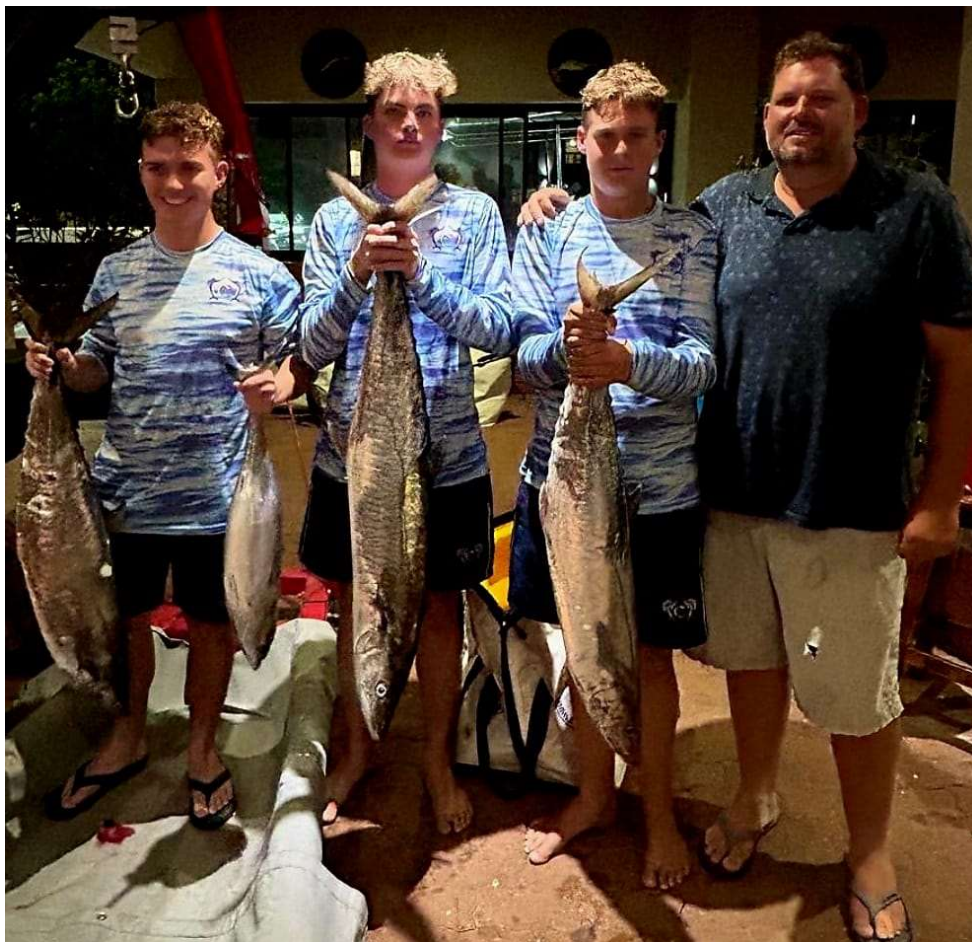
Catch for the Day

Another launch from Durban SBC, this time we ran north, and we caught better live bait, (Mozzies, Shad & two Mackerel). After a 60km drive, we arrived at a spot called "Yellowtail" that looked promising, with abundant sea life (Turtles & Dolphins). On the tide change at around 10h00 the fishing turned on. We caught three cuota and a bonnie on live bait and were happy that we were now on the score board.