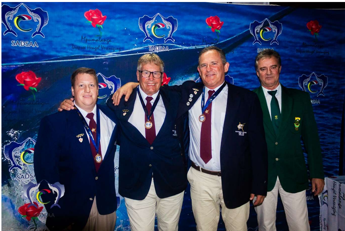
Congratulations to the other Southern Gauteng team who finished in 4 th overall. Once again this was a very well-organized tournament where a lot of knowledge and experience was gained.