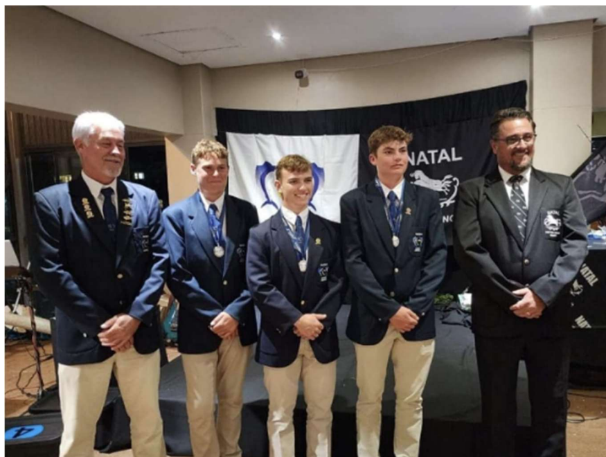
Silver Medallists – SADSAA U19