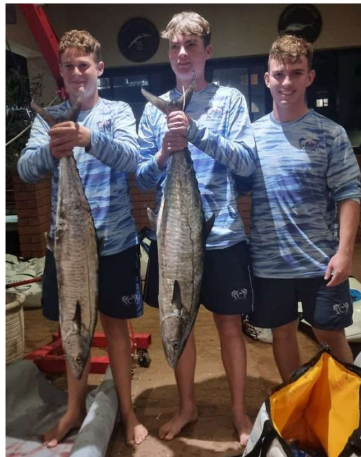
Day 3 Catch