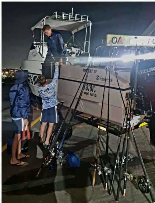
Early morning loading the boat

The weather improved and the conditions allowed us to launch from Granny’s Pool. This is an exciting launch, and our tails were up hoping for a good day. We caught live bait at a secret spot known to our skipper and then continued north to Yellowtail. The bite was slow, fortunately my teammates “Scratched” a cuota each. Well done guys! At the weigh-in, we were very surprised to find ourselves at the top of the leaderboard, with SADSAA seniors & Natal Black behind us.