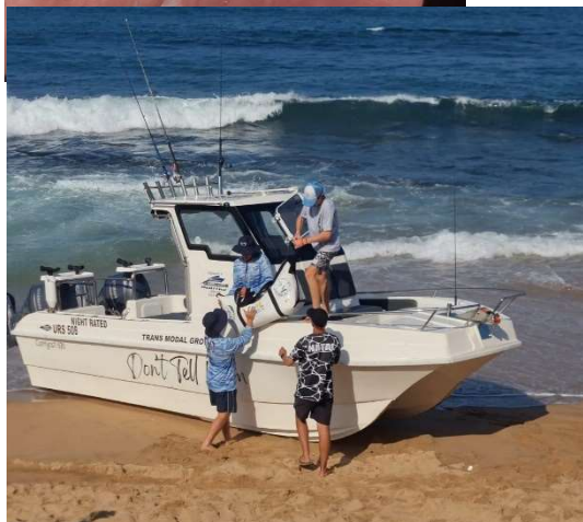
Day 5 Offloading our fish bag

After beaching at Granny's Pool. We unloaded our fish bag, which felt heavy, and nervously eyed out the bags of our opposition. No teams were giving information on their catches, and we would have to wait for the outcome.