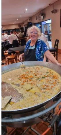
Legendary paella at the closing function