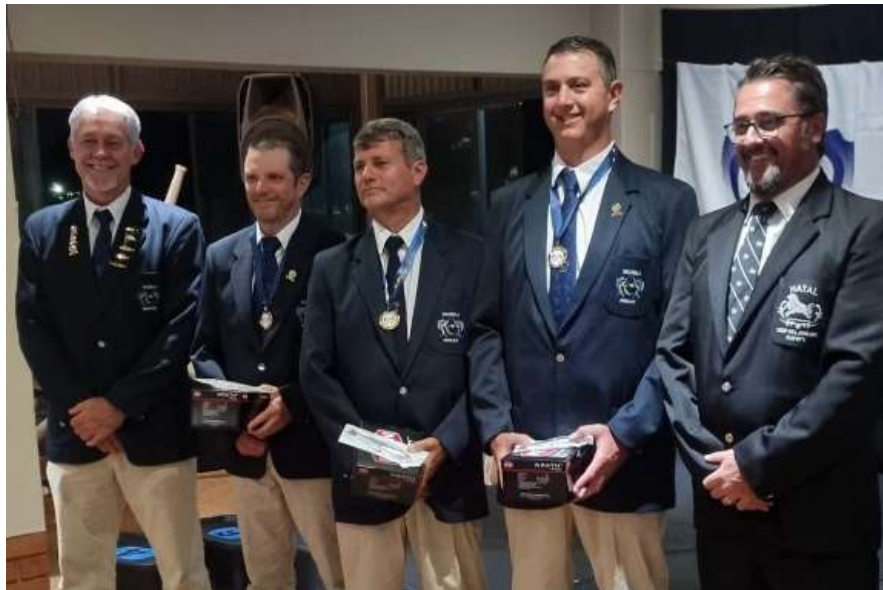
Gold Medallists – SADSAA

When it was our turn, we were disappointed that two of our species did not make the weight by a few grams, So Close! When our opposition cheered on our fish not making the weight we felt good, as we realized we had been decent competition. Only two of our fish weighed a snoek and a kingfish.