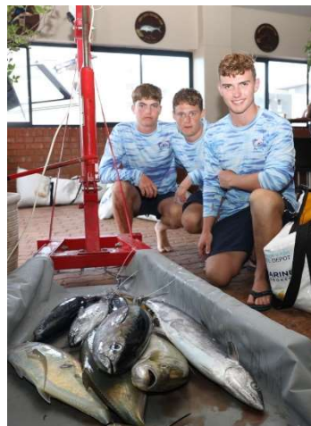
Day 5 catch

At the final weigh-in for the competition, the excitement was in the air as one by one, the fish bags were brought to the scale.