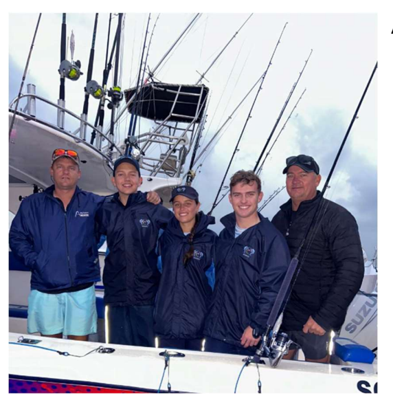
A misty morning!