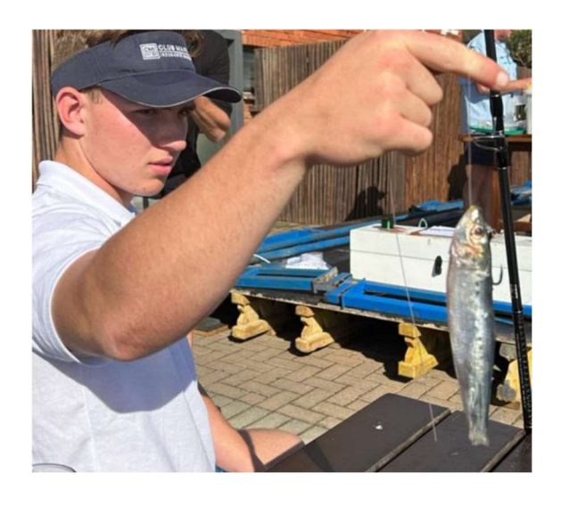
Day 5: Friday 28 June