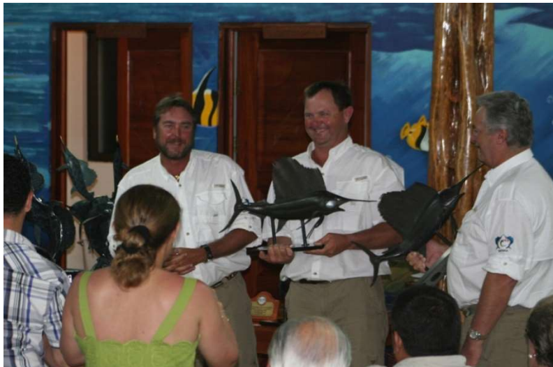
Prize Giving, Proteas bringing the Silverware back home 30 th International Tournament de Pez Vela in Costa Rico.

We are planning to fish the Nomads Closed next year, and looking forward to making more fond memories, so if all’s well, we will see you on the water in 2025 at Vidal on my 19 ft Tomcat “Sea Gull”.