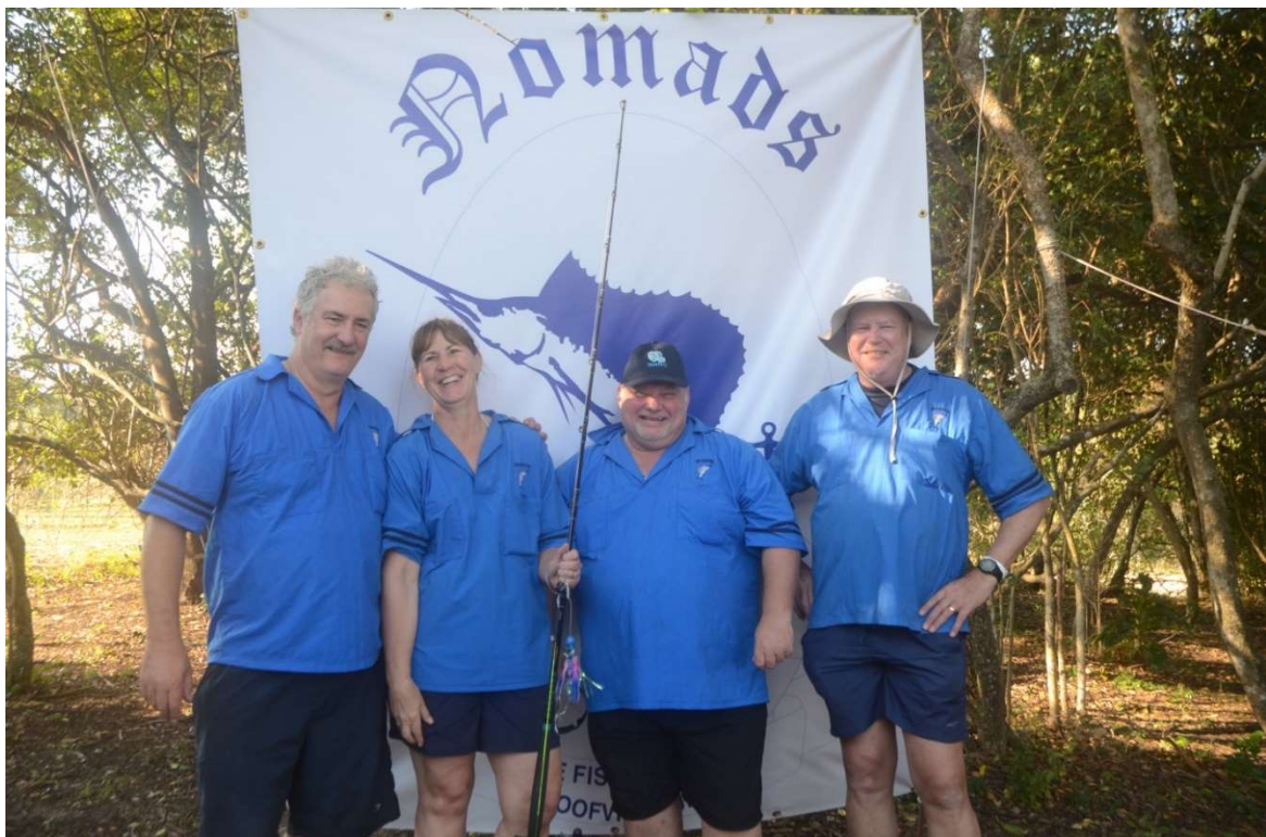
Team "My Dream"