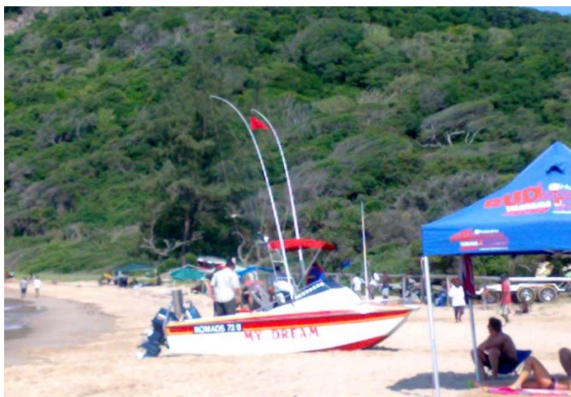
“My Dream” Nomads Closed – Ponta 2008