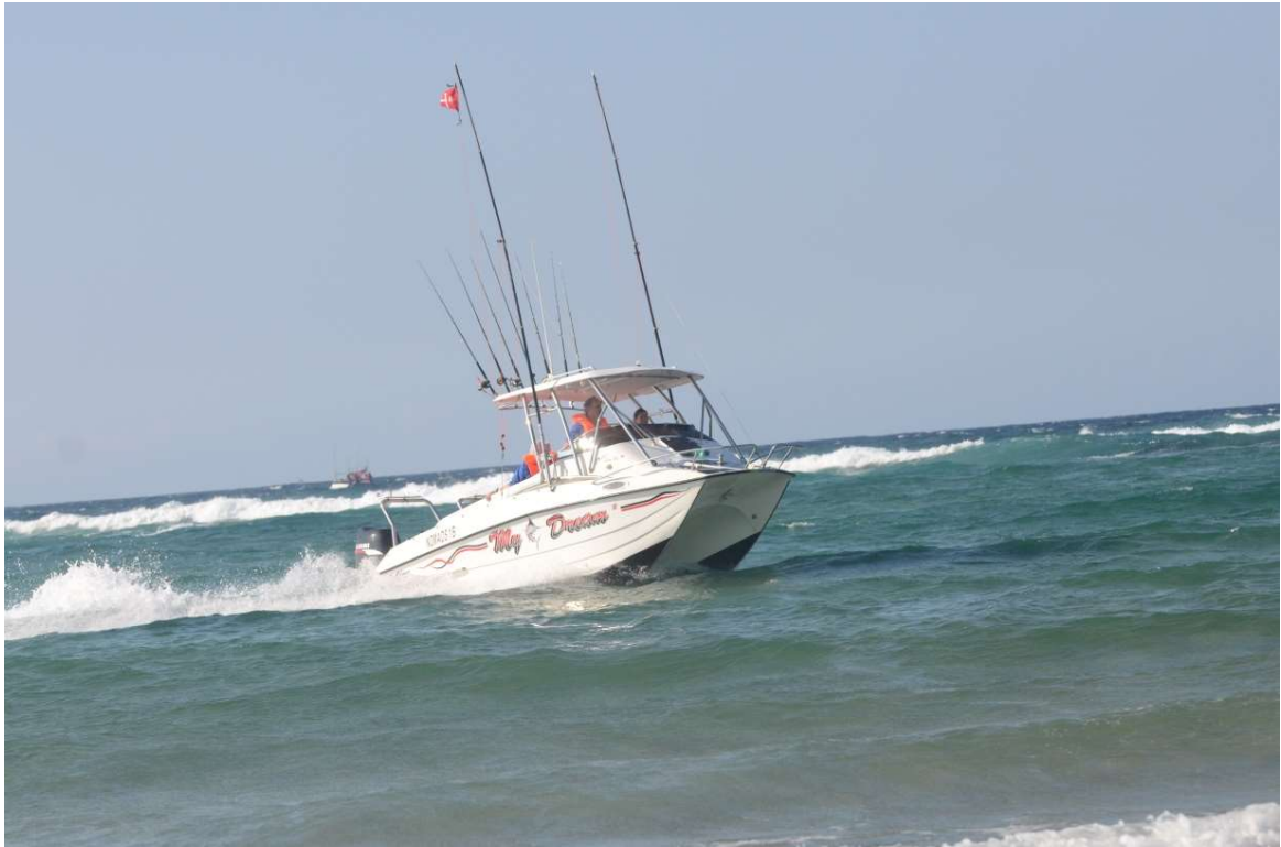
Rosebowl – Sodwana Bay 2013 – Magriet released her First Sailfish on 6kg line